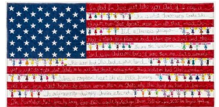
The Revolution Kind by Kathryn Pellman

FREE TO SP%@K! Dates: October 3, 2025 — January 7, 2026. Location: Village Well Books & Coffee – Studio, 9900 Culver Blvd, Culver City, CA 90232 Exhibit Description: Fiber art as protest: three SoCal artists transform fabric, text, and tradition to confront censorship, free speech, and democracy.